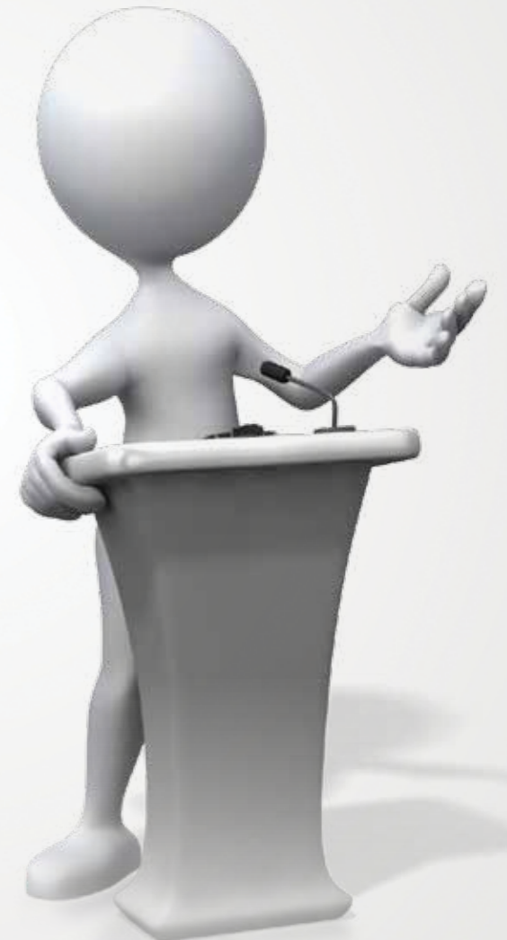
Generate, Disseminate & Preserve Knowledge

Our events are primarily designed to generate open discussion between delegates, keynote speakers, sponsors & partners, while creating an environment to learn and do business. Take a moment to review our events for 2017 and if we can provide you with any further information please let us know.